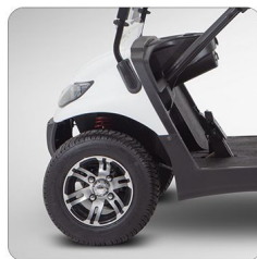
10" Alloy Rims