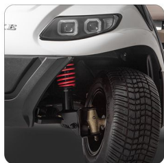
McPherson Independent Suspension