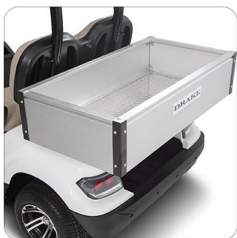
Rear Cargo Box