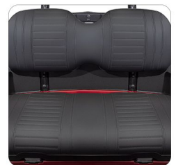
Black Seats (stitched or smooth)

Additional Base Model Features include: LED Headlights + Taillights - Flickers - Warning Lights - Fender Flares - Fender Flares - Dual USB Charging Ports - Non-Universal Key Switch - Premium Steering Wheel - Rear Cargo Box - Hooter - Battery Level Indicator - Extended Roof Canopy - Reverse Buzzer - Fully Foldable Rear Seat - 10" Turf Tyres & Rims