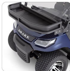
LED Headlights & Taillights