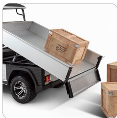
Storage Under Seats