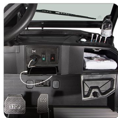
2 Lockable Compartments