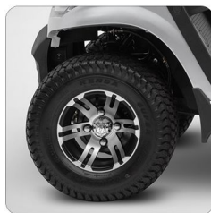
Super Turf Tyres