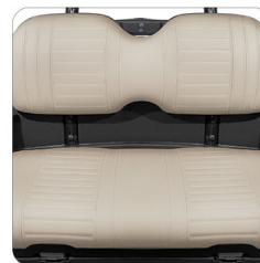
Champagne Seats (stitched or smooth)