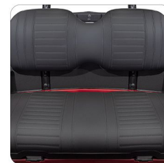
Black Seats (stitched or smooth)

Additional Base Model Features include: LED Headlights + Taillights - Flickers - Warning Lights - Foldable Windshield - Dual USB Charging Ports - Side Mirrors - Coolerbox - Club & Ball Washer - Speedometer - Sand Bottle - Non-Universal Key Switch - Premium Steering Wheel - Rear Storage Basket - Hooter - Battery Level Indicator - Reverse Buzzer - Roof Drainage Holes - Corrugated Aluminium Floor - 10" Super Turf Tyres and Rims Optional Accessories include: Cerwin Vega Bluetooth SoundBar - Custom Marine Vinyl Seats - Rear Caddie Foot Stand - Custom Colour Panels - Rear Bag Cover - Weather Enclosure - Canvas Storage Cover. Enquire for more info on optional accessories.