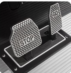
Automatic E-Parking Brake