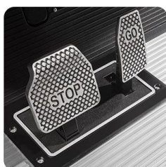
Automatic E-Parking Brake