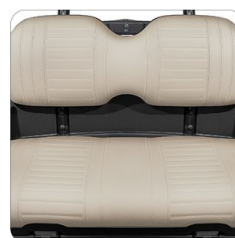
Champagne Seats (stitched or smooth)