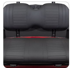
Black Seats (stitched or smooth)

Additional Base Model Features include: LED Headlights + Taillights - Flickers - Warning Lights - Speedometer - Dual USB Charging Ports - Non-Universal Key Switch - Premium Steering Wheel - Corrugated Aluminium Floor - Hooter - Battery Level Indicator - Reverse Buzzer - Fully Foldable Rear Seat - Extended Roof Canopy - 10" Turf Tyres and Rims