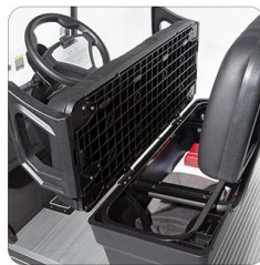
Front Seat Storage