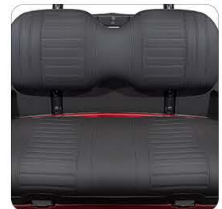
Black Seats (stitched or smooth)

Additional Base Model Features include: LED Headlights + Taillights - Flickers - Foldable Windshield - Dual USB Charging Ports - Side Mirrors - Non-Universal Key Switch - Premium Steering Wheel - Extended Roof Canopy - Front Seat Storage Compartment - Rear Semi-Foldable Seat Configuration - Hooter - Battery Level Indicator - Reverse Buzzer - 10" Alloy Rims and Normal Profile Tyres