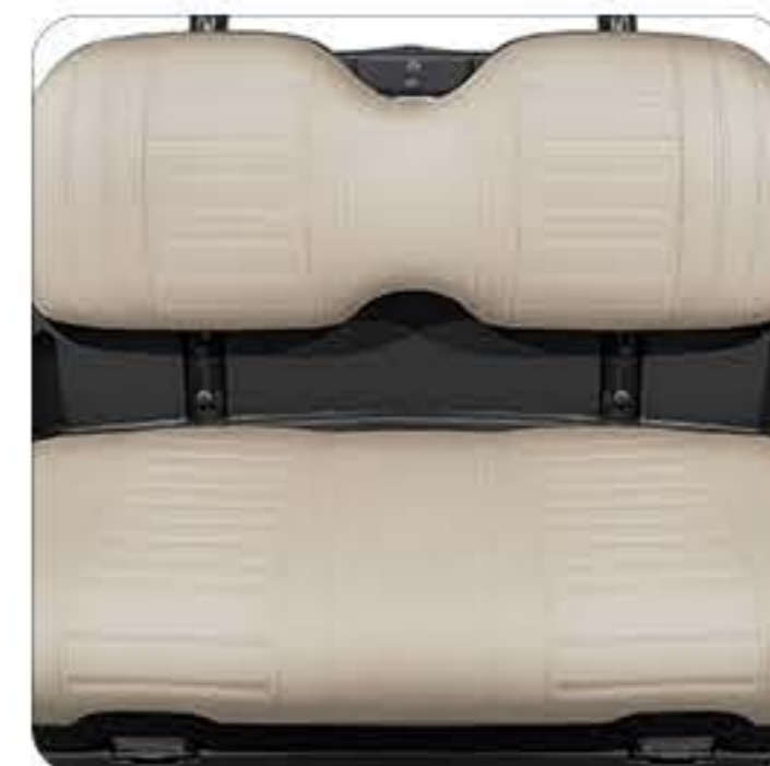
Champagne Seats (stitched or smooth)