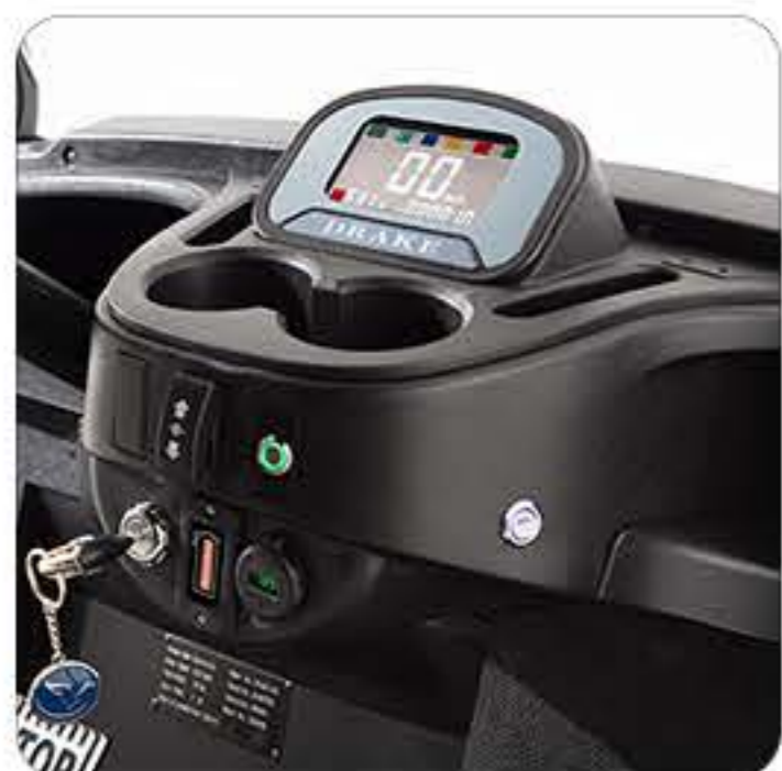
Digital Dashboard with Speedometer