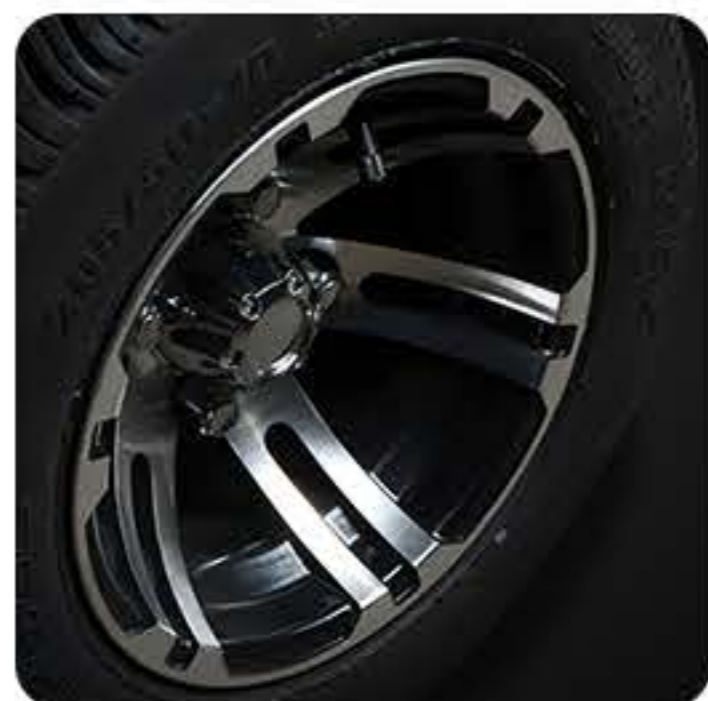
10" Alloy Rims and Normal Profile Tyres