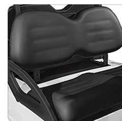
Beige Seats or Black Seats

Additional Base Model Features include: Headlights + Taillights - Side Mirrors - Centre Rear View Mirror - Dual USB Charging Ports - Curtis 840 Meter - Hooter - Battery Level Indicator - Reverse Buzzer - Fully Foldable Rear Seat With Hidden Storage Compartment