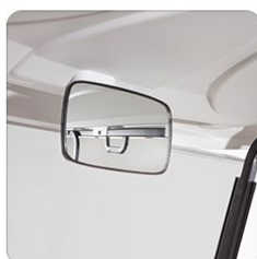
Rear View Mirror