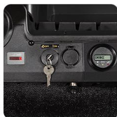
Digital Dashboard Feature