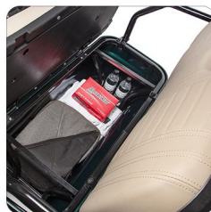
Front Seat Storage Compartment